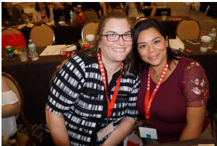
Student Day, Florida Dental Hygiene Symposium